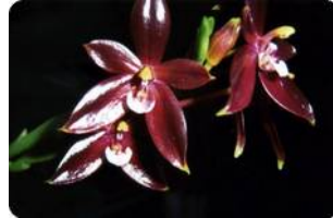
Phal. cornu-cervi var. Vini Wan Kou