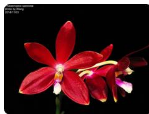
Phal. speciosa Deep Red x self