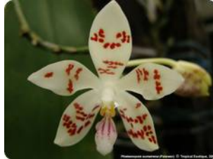
Phal. zebrina Palawan