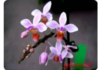
Phal. equestris Aparri