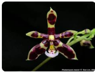
Phal. mannii Black