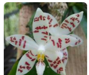
Phal. sumatrana Palawan x zebrina Palawan