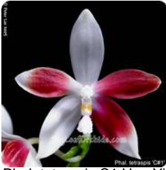
Phal. tetraspis C1 Hua Yi