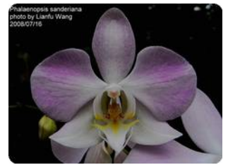
Phal. sanderiana Silver Leaf