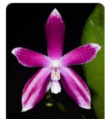
Phal. speciosa fom. imperatrix Purple