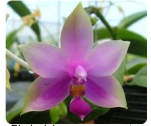
Phal. violacea var. sumatra