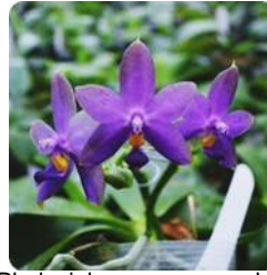
Phal. violacea var. coerulea KF x self