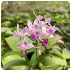
Phal. equestris peloric 3 Lip