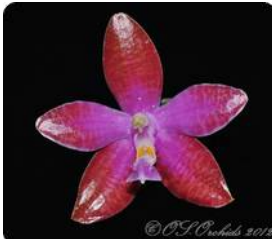
Phal. lueddemanniana Dark