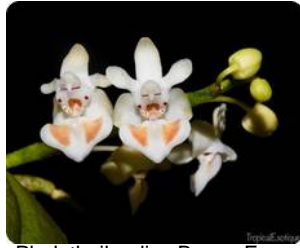
Phal. thailandica Brown Form