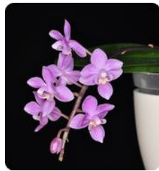
Phal. equestris rosea