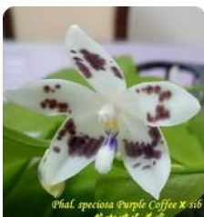
Phal. speciosa Purple Coffee x self