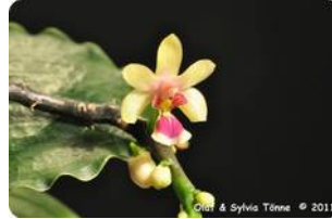
Phalaenopsis deliciosa var. hookerianum