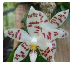
Phal. sumatrana Palawan x zebrina Palawan