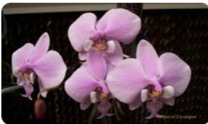
Phal. schilleriana TKP