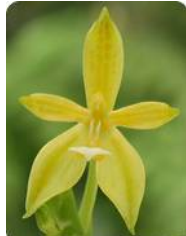
Phal. cornu-cervi flava