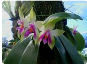
Phal. bellina 'wild selected'