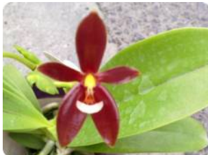
Phal. cornu-cervi forma Chattaladae