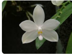
Phal. tetraspis var. alba