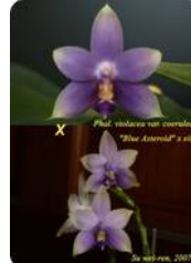
Phal. violacea var. Indigo Blue