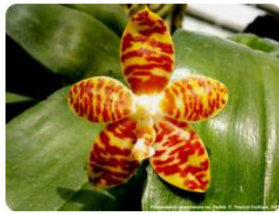
Phal. amboinensis var. flavida