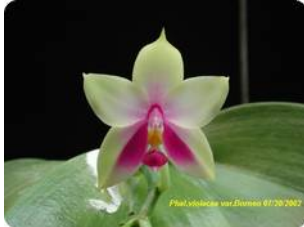
Phal. bellina 'Ponkan'