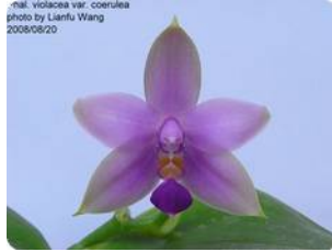
Phal. violacea var. coerulea