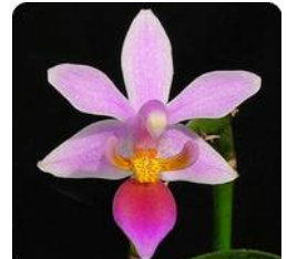
Phal. equestris rosea