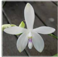
Phal. tetraspis 'Blue Lip'