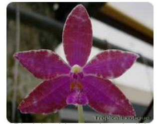
Phal. lueddemanniana 'solid red'