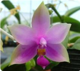
Phal. violacea var. sumatra