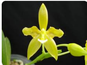
Phal. cornu-cervi var. flava 'Unique'