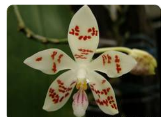
Phal. sumatrana var. Zebrina