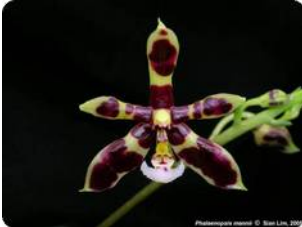
Phal. mannii 'Black'