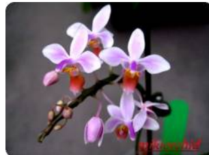
Phal. equestris 'Apari'