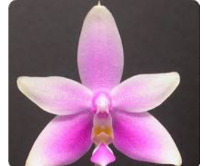
Phal. violacea var. Mentawai