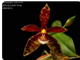
Phal. cornu-cervi 'Dark Red'