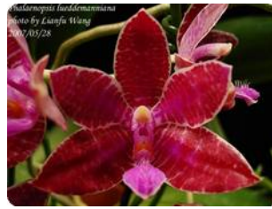
Phal. lueddemanniana 'Dark Red'