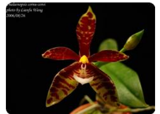
Phal. cornu-cervi 'Red'