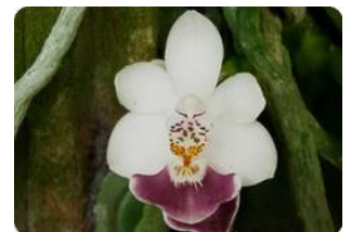
Phal. parishii 'Purple Lip'