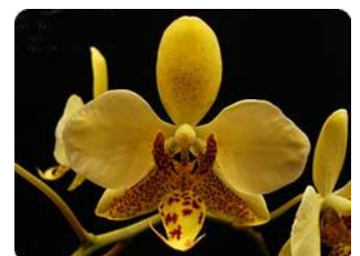
Phal. stuartiana var. nobilis