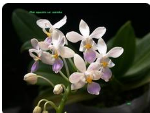
Phal. equestris var. coerulea