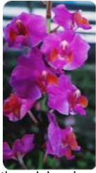
Doritis pulcherrima var. buyssoniana