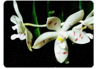
Phal. tetraspis x tetraspis C#1