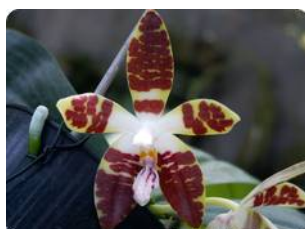
Phal. sumatrana 'South Thailand'